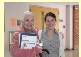
LWWHL groups and participants, Fall 2012–Spring 2013