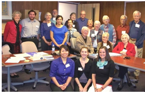
Living with Hearing Loss Group, UA campus

who cannot come in to the University of Arizona or who simply want more information. We include staff and caregiver training in these outreach