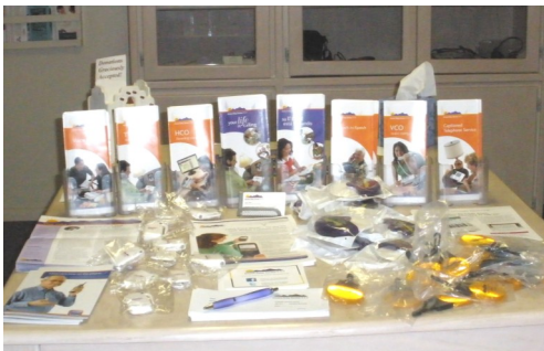
Captioned Telephone display by Hamilton CapTel

To use CaptionCall, you need three basic