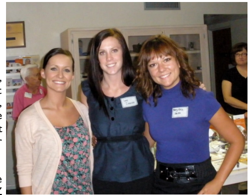
LWHL Assistants helping with the telephone session

If you are interested in more information about Hamilton CapTel please visit their website at: