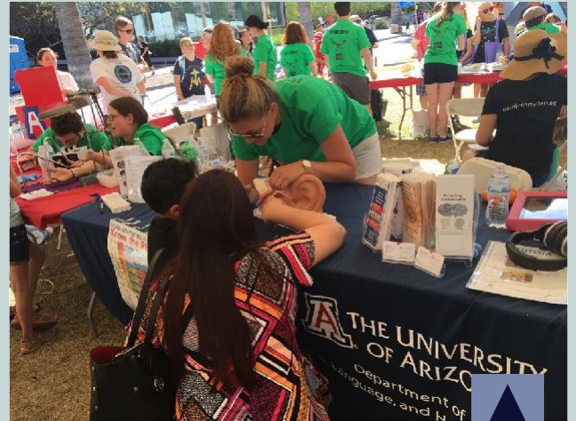
Tucson Festival of Books, March 11-12

Seen Around Town Maximizing communication includes use of assistive technology in our everyday life. Members of our LWHL team often encounter “looped” environments around town where listeners can utilize telecoil technology. Keep an eye-out for the telecoil sign when you visit the