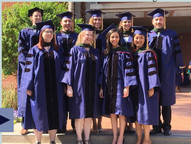
Tucson Botanical Gardens.

We would like to congratulate our graduating class of Spring 2017! Of this year’s Doctor of Audiology graduates, four completed their Audiology Doctoral Research Projects in our Audiologic Rehabilitation Laboratory. We are eager to see where their careers take them!